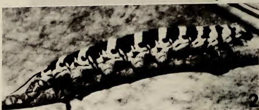
FIGS. 1 & 2. Pseudosphinx tetrio stages: 1, egg cluster; 2, fifth larval instar.

and measured 2.2 \times 2.5 mm ( n = 11 , sd < 0.1 ). Ninety of the 96 eggs hatched, two larvae were found with part of their intestine protruding from a lateral injury, which I presumed was caused either by the edges of the shell or by cannibalism of other larvae. Two of the six eggs that failed to hatch had a small hole in one of the extremes (parasitism?). Eclosion takes place synchronously, at least three days ( n = 90 , sd = 0 ) after oviposition.